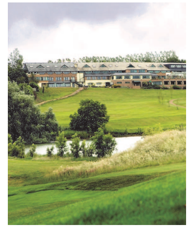
Hellidon—view of hotel and golf course