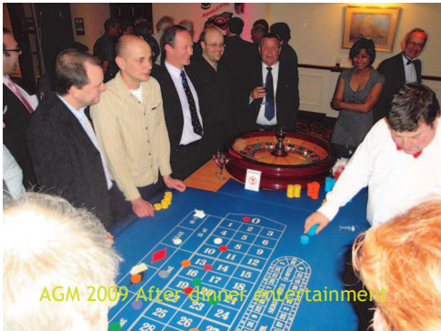
AGM 2009 After Dinner Entertainment