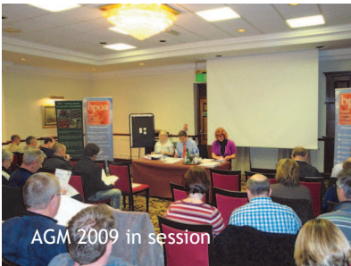
AGM 2009 in session

For further details on Hellidon Lakes log on to www.QHotels.co.uk