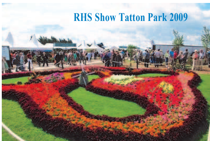
RHS Show Tatton Park 2009