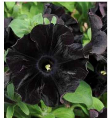
Petunia 'Black Velvet'