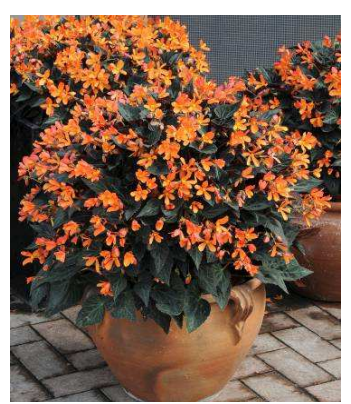
Begonia 'Glowing Embers'

Begonia 'Glowing Embers' has already been a prize winner for Allensmore Nurseries appearing in several summer shows this year. An introduction from Ball Colegrave it is one of the Blue Flag winners, voted by growers, from their recent open days. The interestingly variegated Impatiens 'Masquerade' was a mutation found by grower in a batch of seedlings and the black petunia ' Black Velvet' a unique new introduction.