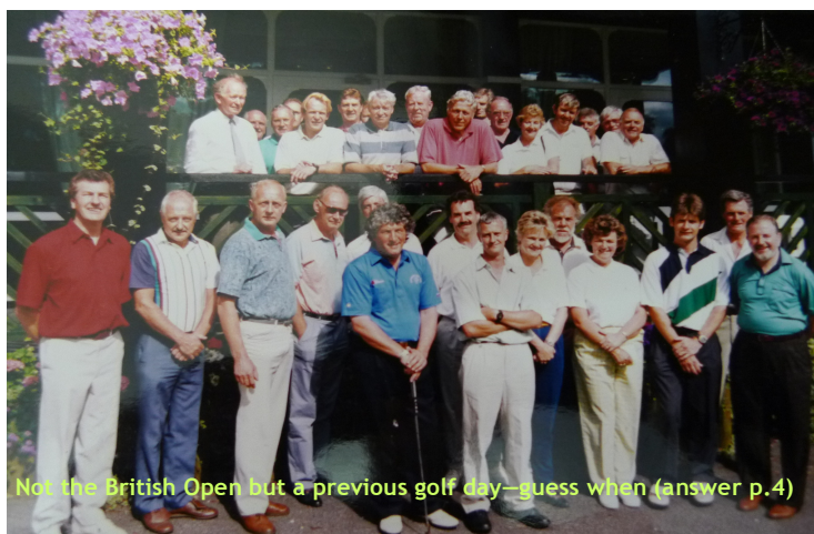
Not the British Open but a previous golf day—guess when (answer p.4)

The temperature never seemed to rise much above three degrees, but the competition was played in good humour and was as competitive as ever.