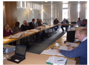
Technical committee in session recently at NFU offices, Stoneleigh.