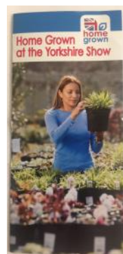
(Continued on page 4)

The team building the stand pride themselves on their reputation for the quality of the produce they present and the design of the elements within the overall stand. Taking their lead from the Yorkshire NFU campaign 'Pride & Provenance' they displayed the ban-