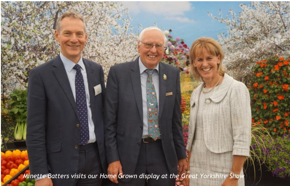
Minette Batters visits our Home Grown display at the Great Yorkshire Show