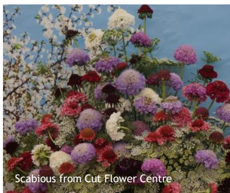
Scabious from Cut Flower Centre

been very high; they wanted to reward the excellent amateur vegetable growers stand this year with the champions trophy.