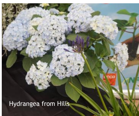
Hydrangea from Hills

In addition, we were assisted by local nurseries in Knaresborough: Park Nurseries and Moorland Garden Centre. This year a Silver Gilt Medal was won by the group staging the display and the judges commented that the standard had