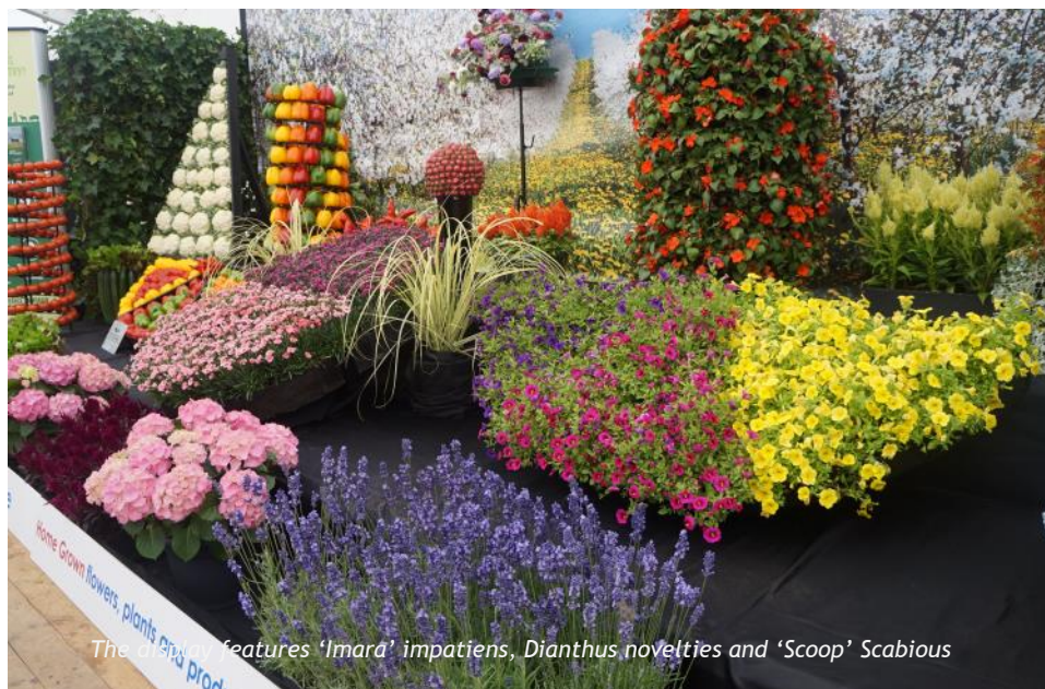
The display features 'Imara' impatiens, Dianthus novelties and 'Scoop' Scabious